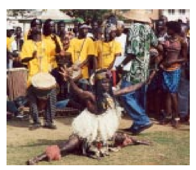
A Roots festival dancer.

For showers people use ten or fifteen liter buckets. You need a bucket of water, a cup, soap and sponge. Take water with the cup and pour it over your body from the head and then clean with soap and sponge.